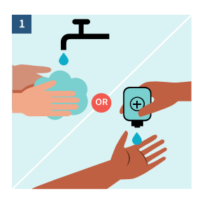
Wash your hands with soap and water for 20-30 seconds, or use alcohol-based hand sanitizer before touching the face mask.