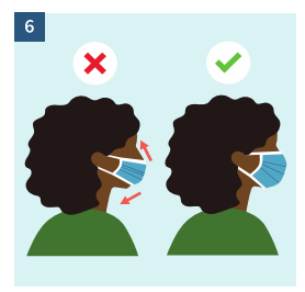
Cover mouth and nose fully, making sure there are no gaps. Pull the bottom of the mask to fully open and fit under your chin.