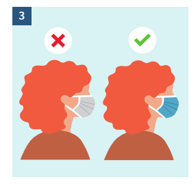
Ensure colour side of the mask faces outward.