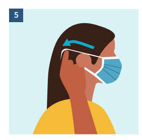
Place an ear loop around each ear or tie the top and bottom straps.