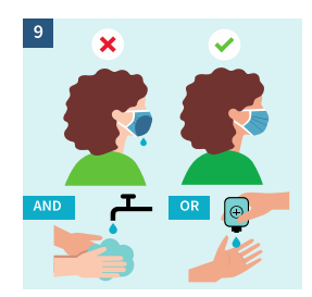
After you remove the wet or dirty mask wash your hands. Put the new mask on and wash your hands again. Do not reuse a mask.